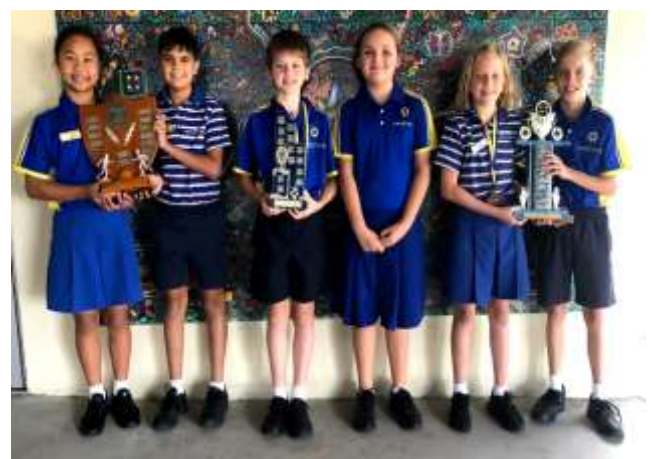
Breslin Captains, Murlay Captains, Marsden Captains