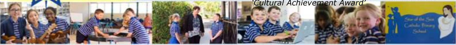
'Cultural Achievement Award'